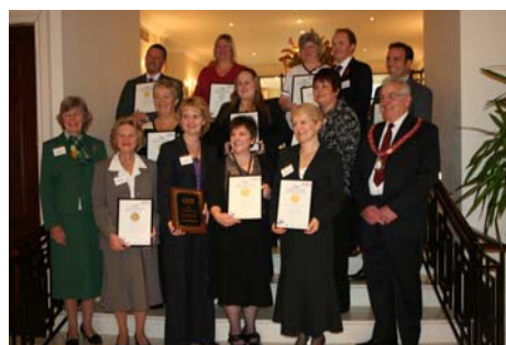
Local businesses receiving their awards.

The Hart Healthy Workplace Awards were presented recently at the glamorous Four Seasons Hotel in Dogmersfield to local businesses which showed exceptional care for the health and wellbeing of their workers. All businesses receiving the awards were required to have a smokefree policy including support for the staff in giving up smoking. For further information go to http://www.harthhealthywork.org .