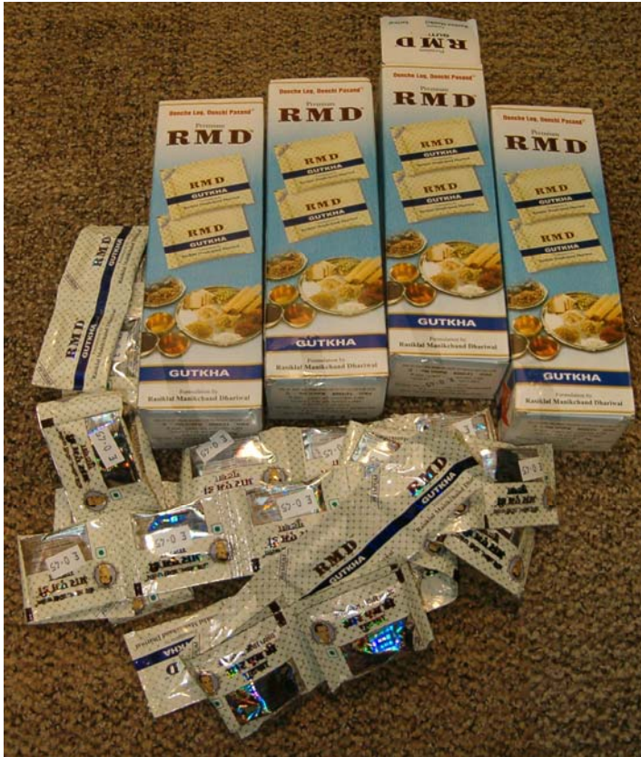
Gutkha – chewing tobacco

“This tobacco product can damage your health and is addictive”